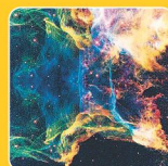
ODOR (Foul Smell)