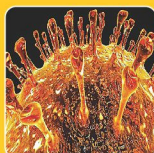
H1N1 (Swine Flu)