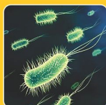
VIRUSES (Common Cold)