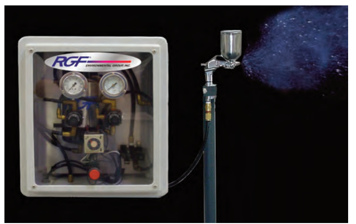
The World's first Sneeze Machine

The solution is to kill the virus at the source before it reaches another person. The problem was how do you do that? RGF Environmental Group has been working with Advanced Oxidation technology since the mid-1980s. RGF's Photohydroionization or PHI<sup>™</sup> technology looked promising as having the ability to kill an airborne virus, from a sneeze or asperator, within three feet. The next problem was how do you validate the results? The validation had to be in a bio test chamber and had to be repeatable. Now, how do you duplicate a sneeze? No two people sneeze alike or not even the same person could duplicate his or her own sneeze. A high-tech sneeze/asperation machine was needed. Of course, there was no such thing, so RGF developed one. When you sneeze, you evacuate one lung of air volume. You expel about one gram of fluid at about 100 miles per hour. RGF invented and built the world's first sneeze/asperation machine with controls for volume, fluid and speed. Now it